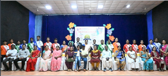
Proud Parent's with young path finders