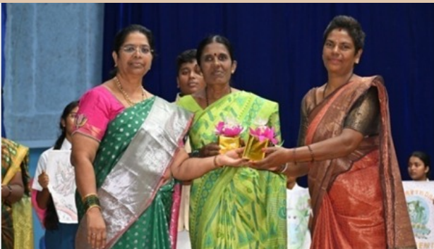
Appreciating support Staff for environment Cleanly