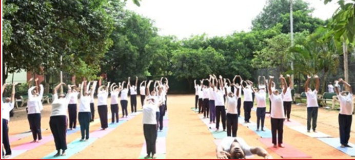
Youngster in Yoga mode.