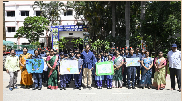
All set to "Plant a tree, Plant a hope"