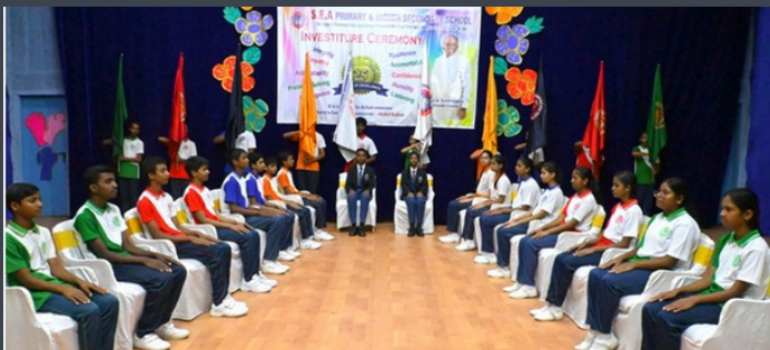
Cabinet of school council